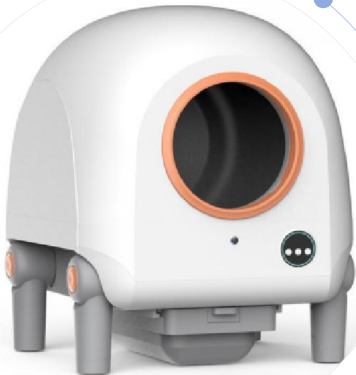
Smart cat litter box, model C