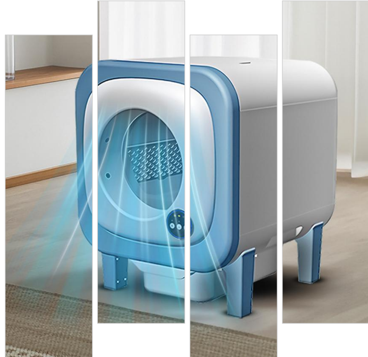
Smart cat litter box, customized model