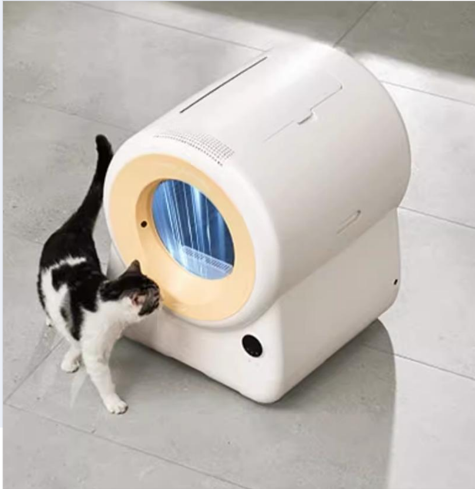
Smart cat litter box, customized model