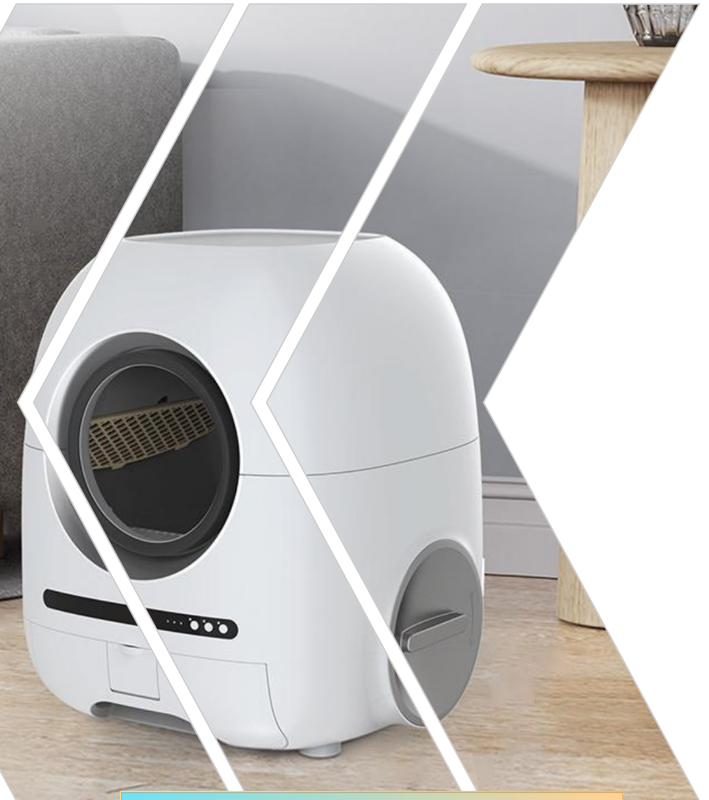
Smart cat litter box, Model B