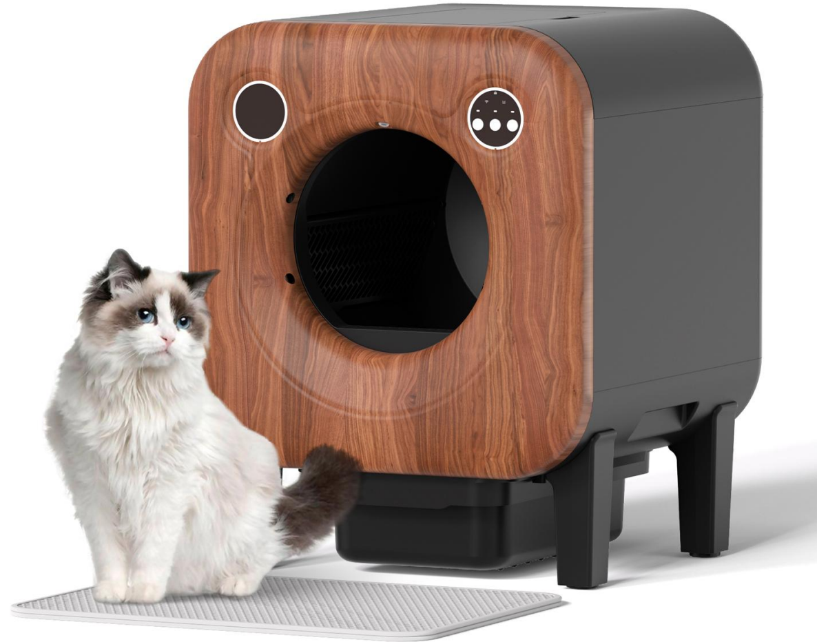
Rich water transfer printing colors