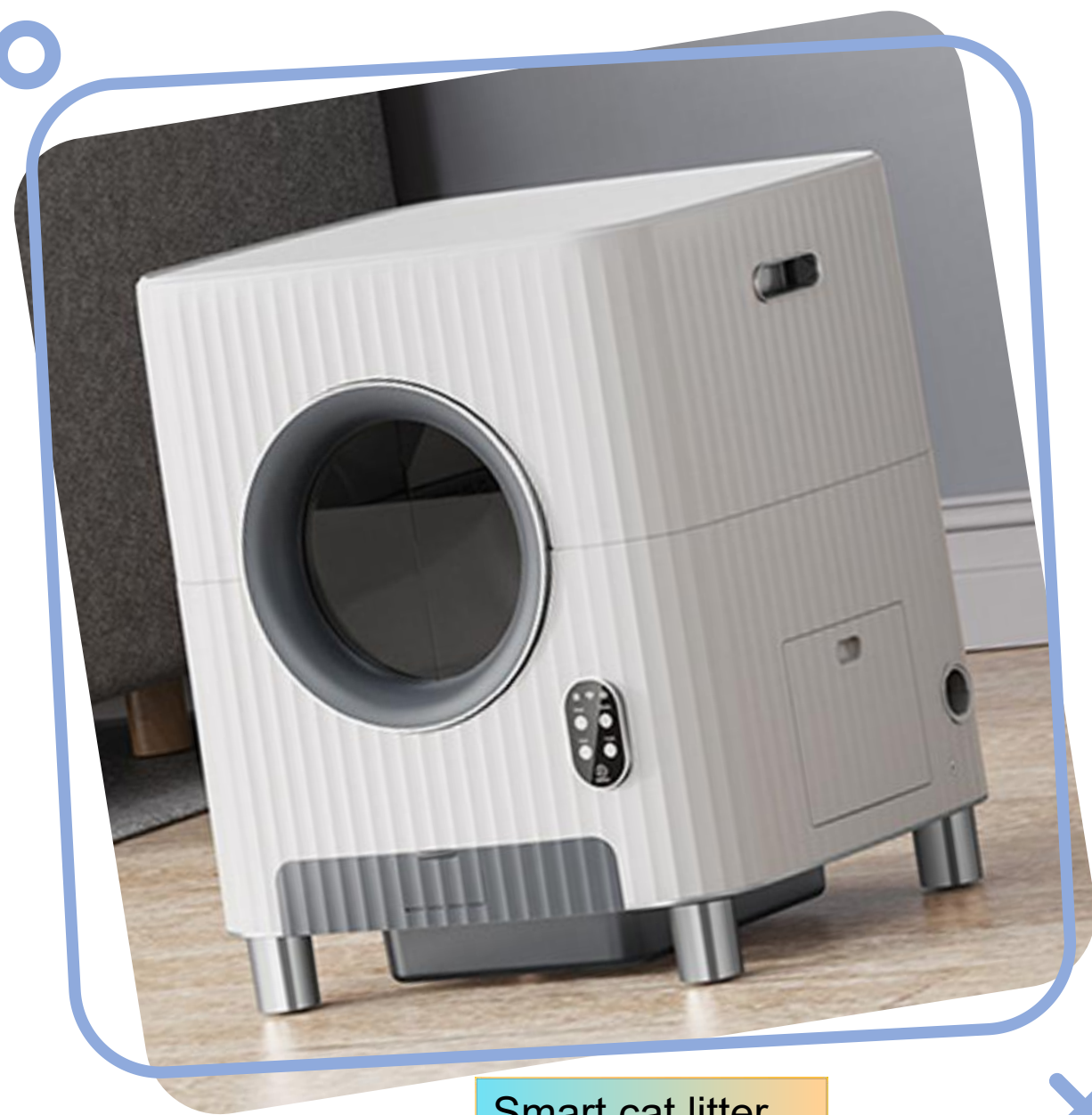
Smart cat litter box, model A