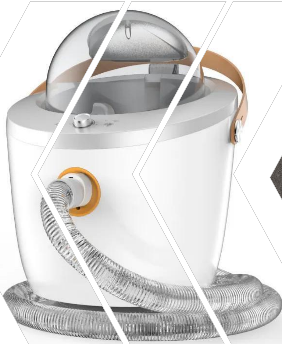
Pet grooming machine